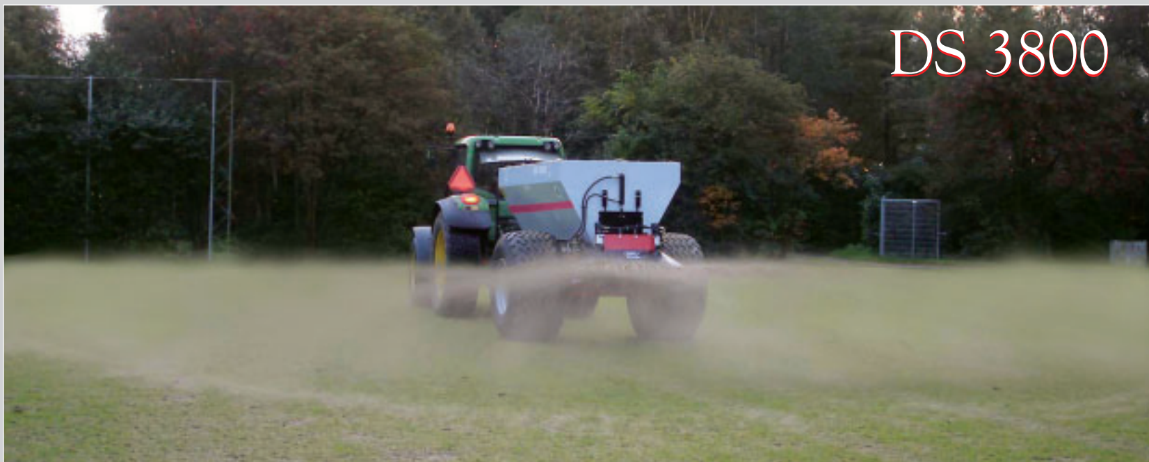
The DS 3800 spreads the material up to 15m (6½ ft) wide