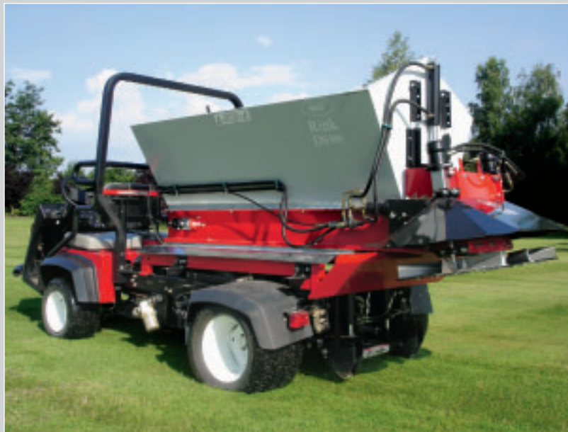
The Rink DS 800 can be carried either on top of the utility vehicle (above) or be pulled (below)