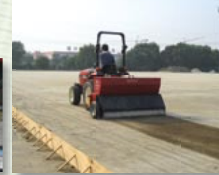
Sept 11, 2007 - The Olympic Grass, for the Beijing Olympics in august 2008, first being planted with the Speed-Seed, producing 1840 holes/m<sup>2</sup> for the seed to drop in.