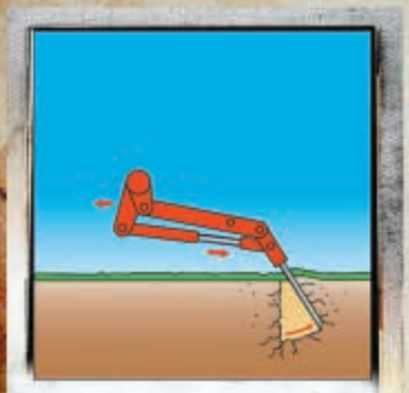
Verti-Drains adjustable parallelogram design shatters the soil, and also allows for clean Coring, on all models.

The 7007 is a concept in deep tine aeration from Redexim North America. This new Verti-Drain* has the walk in front versatility and maneuverability for the superintendent that only uses pedestrian machines on his greens. The 7007 also incorporates the convenience of ride-on ability to get you quickly to the next green.